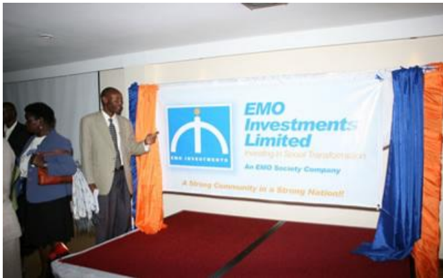
EMO Investments Limited Launched as member looks on.

EMO Community Development Society has officially launched its investment vehicle